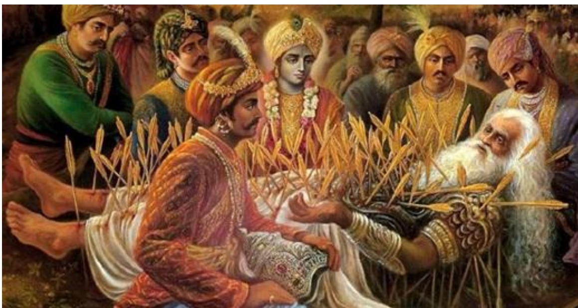
Figure-2: Bhishma Pitamah of Mahabharat going to embrace death.

Euthanasia (from Greek: εὐθανασία 'good death': εὖ, eu 'well, good' + θάνατος, thanatos 'death') is the practice of intentionally ending life to relieve pain and suffering. A mercy killing is the intentional ending of life of a person who is suffering from a terminal, painful illness. The term—also called “right to die”—is most often used to describe voluntary euthanasia, though it is also used in reference to non-voluntary euthanasia and involuntary euthanasia.