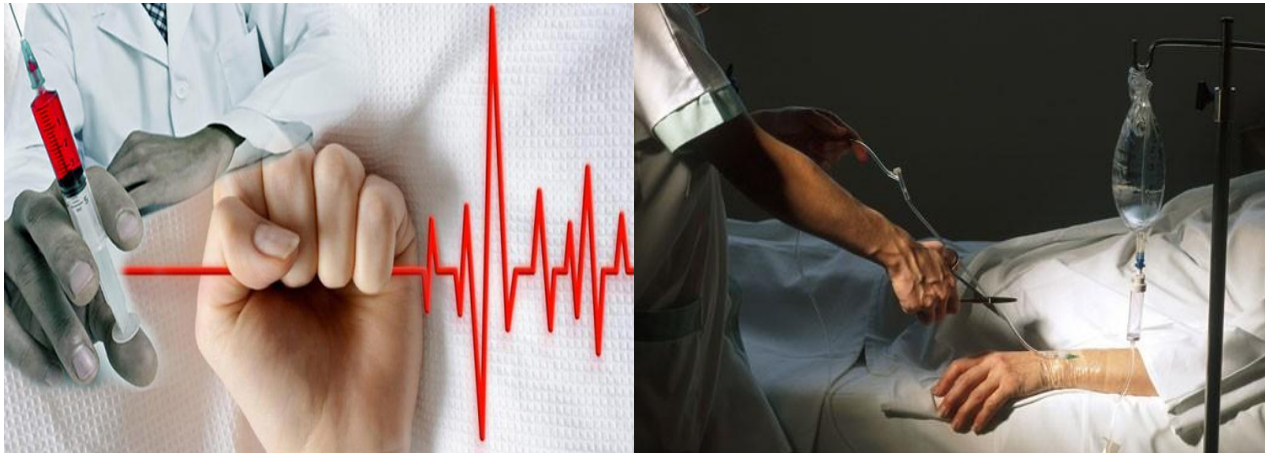
Figure-3: Euthanasia process.

on the part of the patient was not considered one of their criteria, although it may have been required to justify euthanasia. However, others see consent as essential.