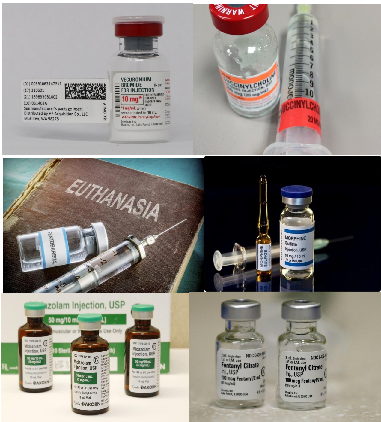
Figure-4: Death drugs.

Furthermore, the cause of suffering underlying the request must have a medical dimension, either somatic or psychiatric, and physicians must report each case to the Regional Euthanasia Review Committees which review all EAS cases regarding whether the due care criteria were met. In the past decade, the percentage of all deceased patients in the Netherlands who requested EAS prior to their death increased, from 5.2% in 2005, to 6.7% in 2011, and to 8.4% in 2015. Also, the percentage of requests that were carried out increased, from 37% in 2005, to 45% in 2010 and to 55% in 2015. Hence, not only is there a growing demand for EAS, requests are