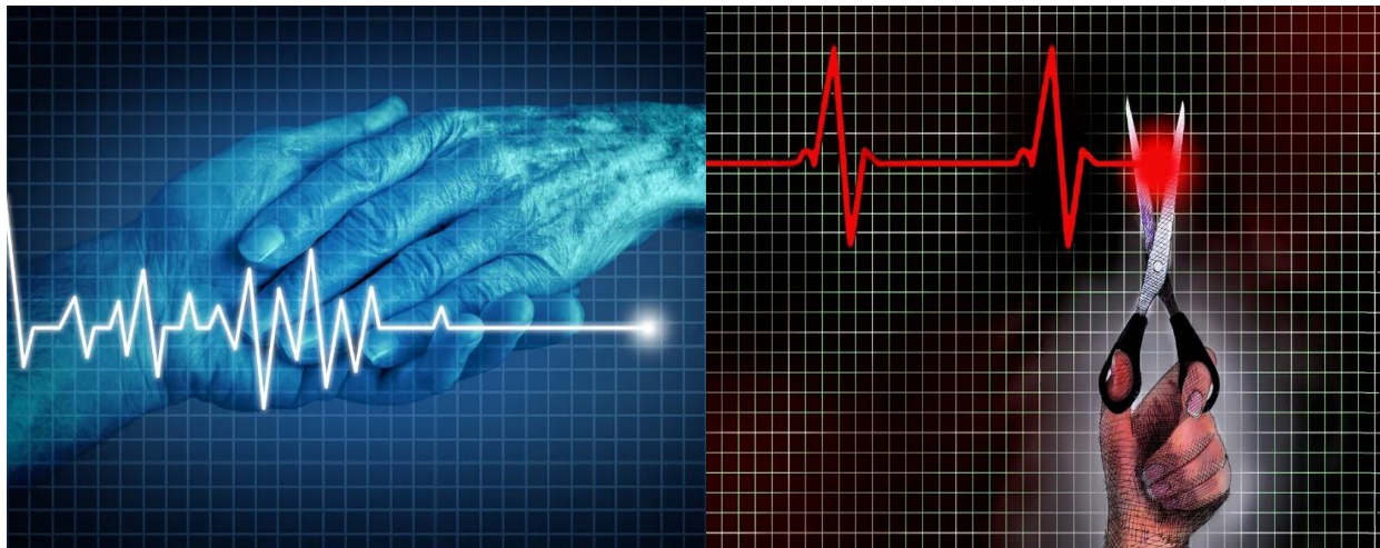
Figure-5: Euthanasia and end of life.

Passive euthanasia was declared legal by Israel's highest court under certain conditions and has reached some level of acceptance. Active euthanasia remains illegal; however, the topic is actively under debate with no clear consensus through legal, ethical, theological and spiritual perspectives.