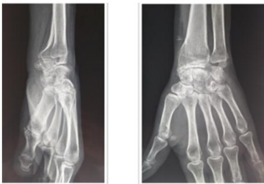
Fig 2: Total destruction of the radio-carpal joint, with changes to the radio-lunar new joint.

Radiographic assessment showing: total radiocarpal and mid-carpal joint pinching, very significant degenerative changes in the bones of the 1st row, with osteoarthritis lesions on the capitatum. (Fig. 2)