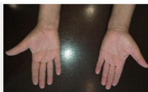
Fig1: No muscular atrophy, the wrist slightly swollen, without other associated signs