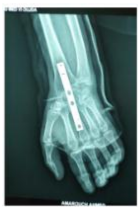
Fig 3: Total arthrodesis (TA) by first-line plate 6 weeks after the operation.

clinical and radiological parameters evaluated was demonstrated. No real gene linked to the lack of mobility and the patient resumed the same work (the sacrifice of mobility was not experienced as a handicap, the repercussions linked to the loss of mobility being considered as absent for the patient).