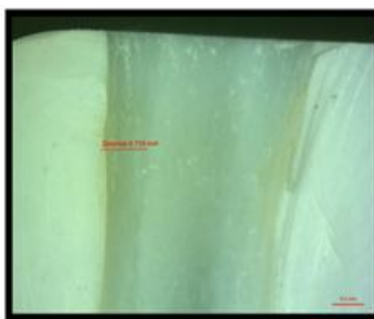
Image 2 showing stereomicroscopic image of Group 2 showing clear precipitate