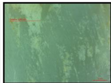
Image 3 showing Stereomicroscopic image of Group 3 showing clear precipitate.