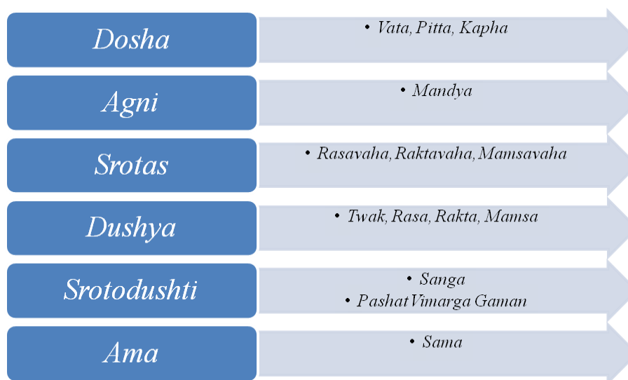
Figure 2: Samprapti Ghatakas of Visarpa .

Dietary factors such as excessive intake of Amla , Katu , Ushna and Lavana food stuffs aggravates Doshas . Frequent and excessive consumption of Shukta , Mandaka , Sura , Kilata , Kurchika , Asatmya and Viruddha Ahara along with vitiated Doshas affect the element of the body which results Vyadhi like Visarpa . The major Samprapti Ghatakas of Visarpa mentioned in Figure 2 .