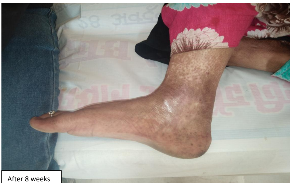
After 8 weeks