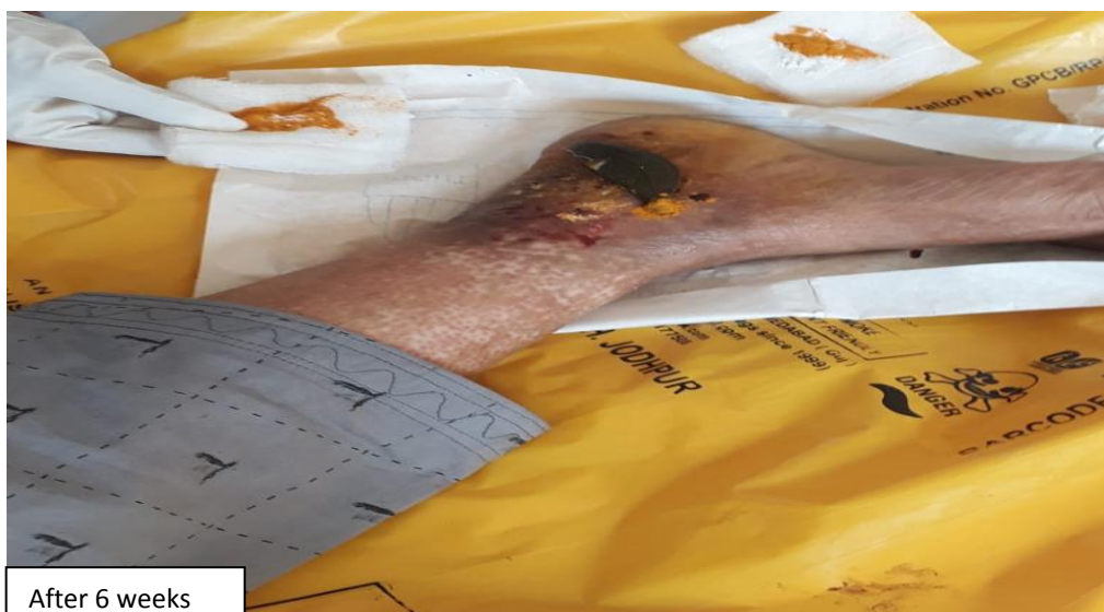
After 6 weeks