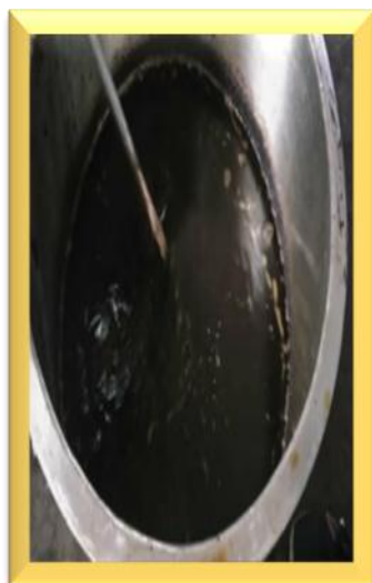
Heating of mixture