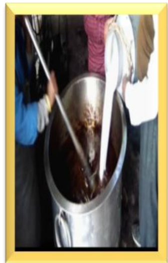
Mixing of Godugdha