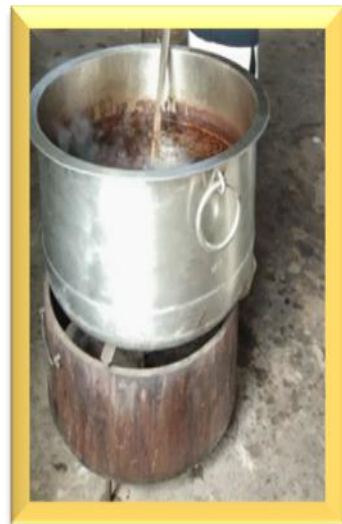
Steering of mixture