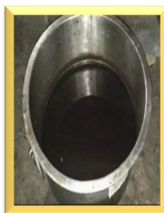
Murchhita Tila Taila