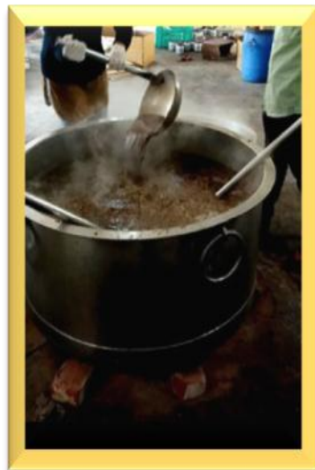
Mixing of Shataavari Kwatha