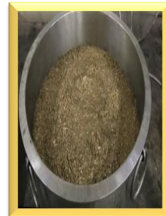
Grinded Kwatha Dravya