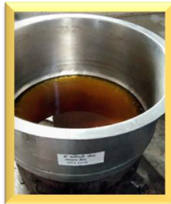
Heating of Tila Taila