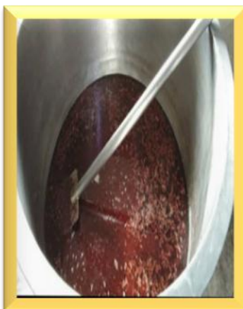
Tila Taila Murchhana