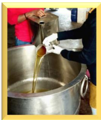
Taking of Tila Taila