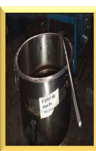
Prepared Narayana Taila