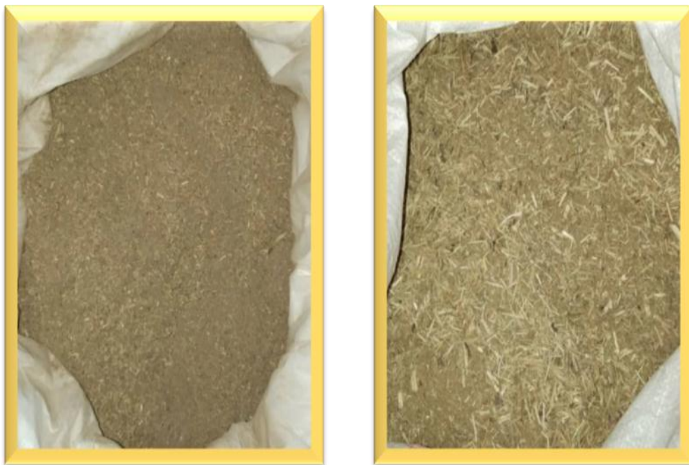
Fig. 1: Grinding Of Raw Drugs.