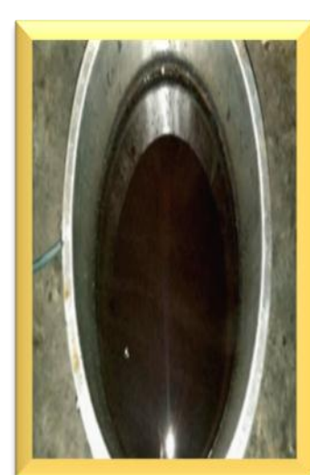
Filtered Narayana Taila