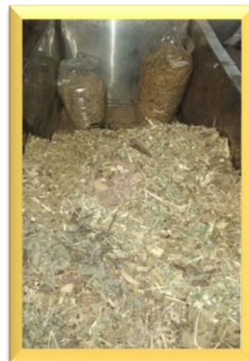
Grinding of Kalka & Kwatha Dravya.