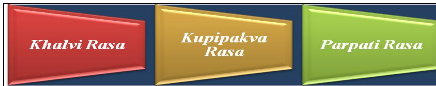
Figure 2: Formulations of ayurveda based on principles of Rasa Shastra.

The concept of Rasa Shastra originates from the preparations of Parada which is considered as Rasa element. The presence of Parada or other metals and mineral in Rasa formulation make them drugs which are to be used or prepared with great care. The improper preparation and utilization of such formulations can leads adverse effects like; skin reactions, hypersensitivity, allergy and palpitations, etc. Therefore it is recommended that physician should be very attentive while prescribing such drugs, similarly chemist should pay attention while preparing such drugs so that desired qualities achieved up to the optimum level.