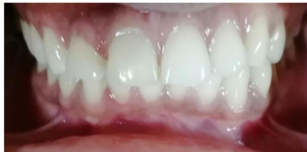
Pre Operative and Post Operative Comparison