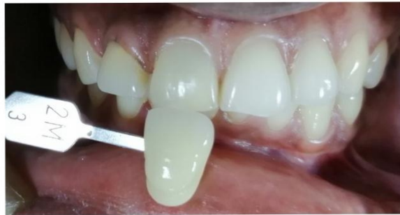
Figure 1: D