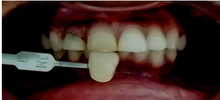
Figure 1: C