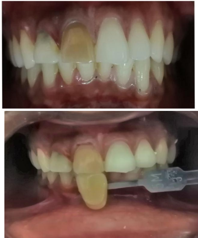
Figure 1: A Pre Operative-Discoloured 11.