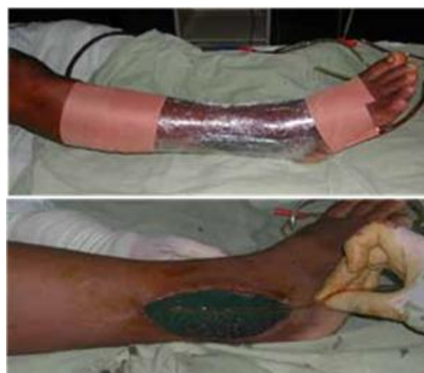
Figure 2: Foam is cut with a metz scissor in the shape of the wound. A Nasogastric tube or an infant feeding tube is placed in a tunnel of the foam. It is then wrapped by saran@wraps. the edges are obliterated by using Leukoplast@ plaster tapes thus making it a sealed dressing.

A pre-sterilized Saran@ wrap or Glad@ wrap (Ioban@, Steridrap@ or any brand of barrier drape) was wrapped around the area. The ends of this seal were then obliterated by applying Leukoplast@ plaster tapes thus making it an air tight seal (Figure 2).