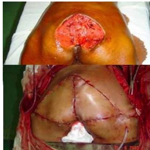
Figure 4: Decubitus ulcer in a 78 year old man. Good granulation tissue bed was achieved after 3 VAc changes. the soft tissue defect was covered using bilateral V-Y Gluteal advancement flaps.

The majority of cases were from open fractures. 98 cases of large soft tissue wounds with or without external fixator including 3 cases of fasciotomies for compartment syndrome were included. Seven cases of peri-operative trauma infections (qualified as infections as problem within 30 days of operation), 16 cases of diabetic wounds were also included. Four decubitus ulcers with large sacral lesions were also treated with VAC, prior to swinging a V-Y gluteal advancement flap, as a way to control infection and stimulate graft bed (Figure 4).