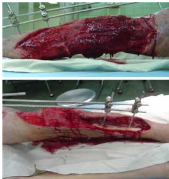
Figure 5: Patient with Open III-c Distal Femur Fracture with popliteal artery injury associated with tibia and fibula fracture who underwent Popliteal Artery Bypass Grafting – note large leg avulsion with exposed tibia. However, it was the Popliteal Artery Bypass Graft that failed at 3 weeks, resulting in amputation.

Next patient was an open type III distal femoral fracture with popliteal artery bypass grafting and associated tibia and fibula fracture. Modified NPWT was set up over the external fixator, extremity developed gangrene due to failure of the popliteal artery bypass after 3 weeks. Patient underwent above knee amputation because of the gangrene. Healthy granulation tissue was observed at the open fracture site. This demonstrated the ability of modified NPWT to stimulate regeneration therefore not truly a failure of the procedure (Figure 5).