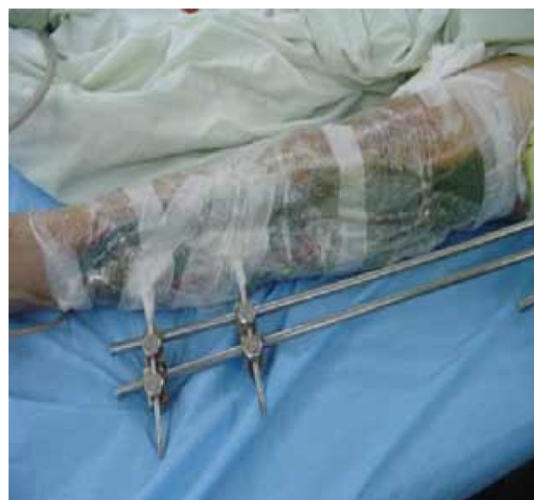
Figure 3: Applying VAC around a external fixator requires an extra effort. the saran@ wrap are slit cut around the pins. Leukoplast@ plaster tapes has to be properly applied around the pins so as to make it a sealed dressing.

The tube was then connected to the suction to check if the foam collapses, if not then we looked for any unsealed area then sealed it with more plaster tapes. In cases of external fixators, slit cuts on the Saran@ wraps were made to seal pin sites and tapes around the pin sites sealed the area adequately (Figure 3).