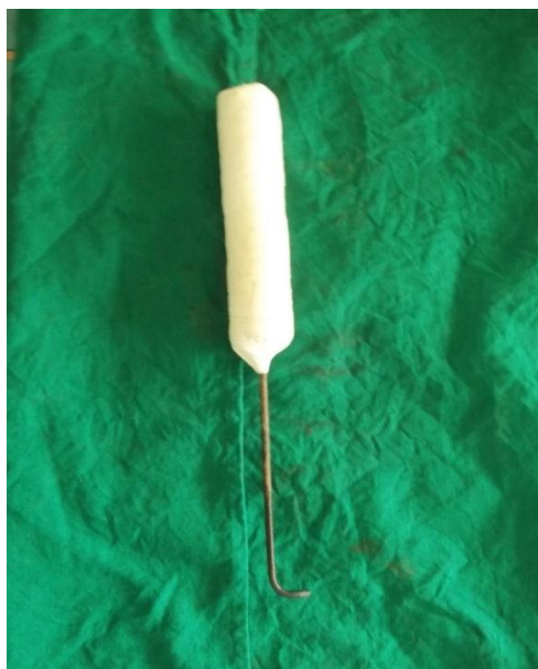
Figure 1: Loha Shalaka.