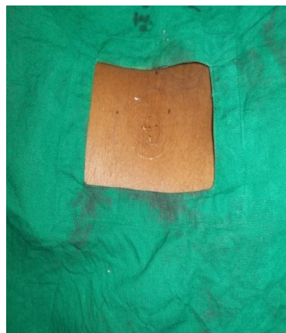
Figure 4: Ghrita and Madhu Lepa.