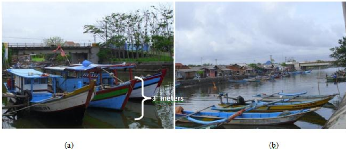
Figure 2: The ship used by fishermen around Kaliyasa Remarks a). Combrengh ships ship height; 3 meters and b). Fiber Ship.

The type of vessel used by fishermen around the location of the cross-country pipeline bridge construction activities has a height that is still below the planned height of a cross-country pipe bridge. Types of vessels such as combrengh have a maximum boat height of up to 3 meters from the surface of the water, so ships used by fishing communities around the construction site of cross-country pipelines when crossing the bridge will not cause collisions with pipes. Sail schedule: depart early in the morning at 03.00-06.00 WIB Returns at noon at 13.00-14.00 WIB. The type of vessel used by fishermen around the location of the cross-country pipeline bridge