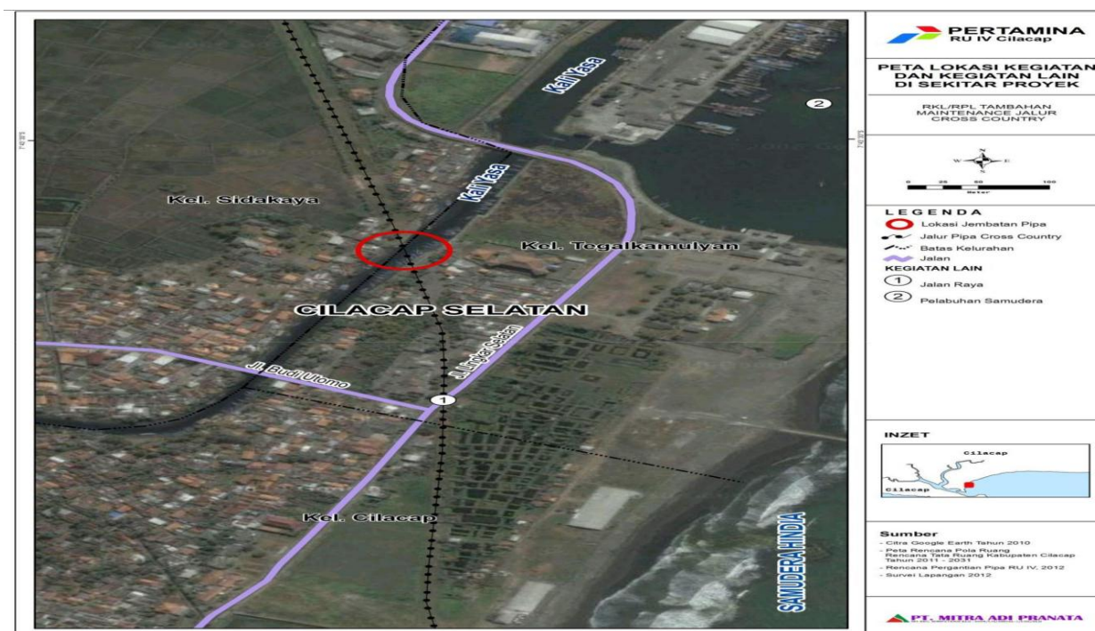
Figure 1: Location map of risk analysis of unit IV CILACAP pipeline maintenance activities in Kali Yasa Rivers.

The activity plan to be explored in this risk analysis study is the planned installation of crossing oil pipelines for the Kali Yasa Rivers from area 40 towards area 70 with the proponent planned activities are PT Pertamina Refinery Unit IV Cilacap . The scope of the study is the study of the Risk Analysis Plan for the Construction of a Cross Country Pipe in the Kali Yasa River located at the coordinate point of 109 ° 1'16,337 " East Longitude - 7 ° 43'36,365" South Latitude, in Figure 1, below: