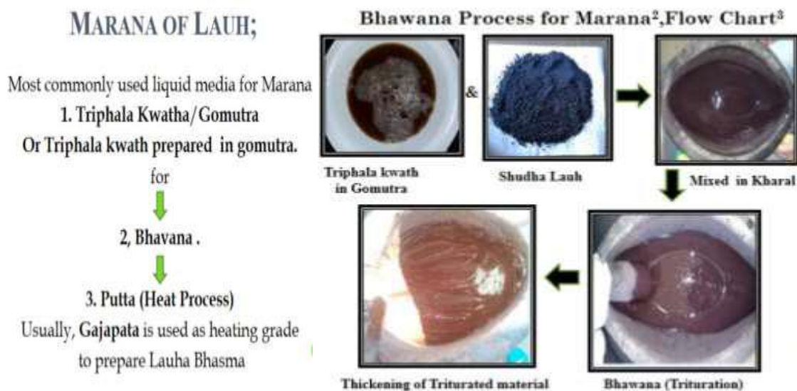
Table 3: Marana of Lauh 7: - Flow Chart Image-2,3,43.