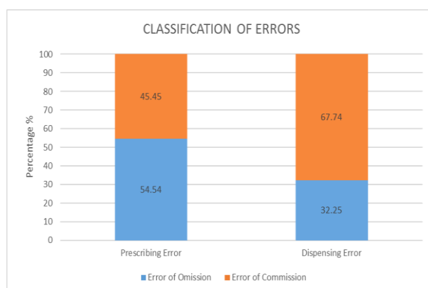
Fig-2: Classification of Errors.