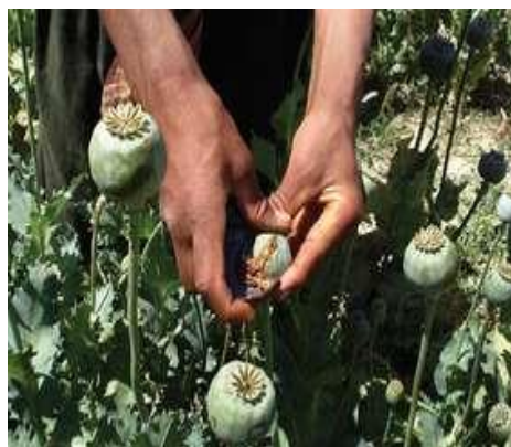
Latex collection of Opium