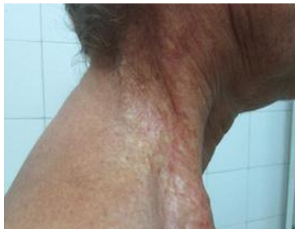
Figure 1: Skin pigmentation and endured area on the anterior part of the neck.

Neurological examination showed facial simetry, decreased visual acuity of both eyes with normal visual field, normal oculomotricity, and no olfactory or sensory abnormalities on face, no nistagmus, but positive Romberg test, without deglutition problems for liquid or solid foods. Motor examination revealed right and left loss of shoulder flexion, internal rotation and abduction worsen on the left part, tendon jerks depressed on biceps and brachioradialis, atrophy of bilateral deltoid, biceps, supraspinatus and infraspinatus accentuated and with fasciculation on the left side. Sensory loss on left and right lateral side of the arm, forearm, hand and thumb were also recorded.