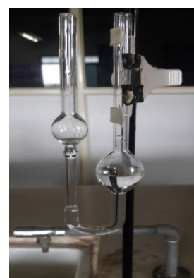
Viscosity for water