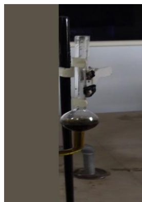
Viscosity for oil