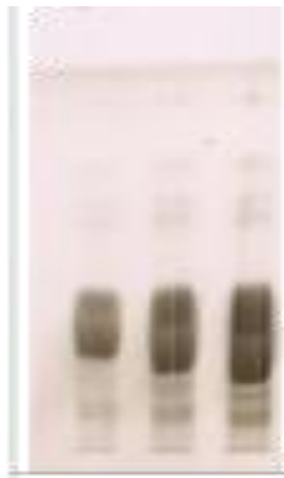
\lambda = 520 \text{ nm} (Derivatized)