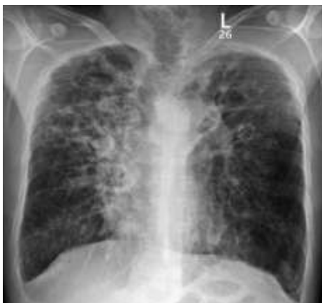
Figure 1: AP Chest X-ray showing dilated trachea and main bronchi with bilateral diffuse interstitial lung markings, nodular shadows and bronchiectasis.

Computed tomography (CT) scan revealed increased diameter of trachea and main bronchi with transversal diameters of the trachea of 4.8 cm, while right and left main bronchi had diameter of 2.9 cm and 2.8 cm