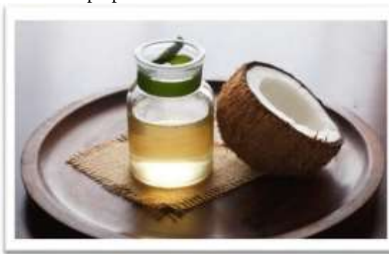
Fig. No. 5: Coconut Oil.

Hydrates skin, reduces inflammation, and exhibits antimicrobial properties.