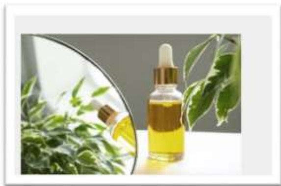
Fig. No 7: Vitamin E Oil.

Protects skin from damage, reduces inflammation, and promotes skin health.