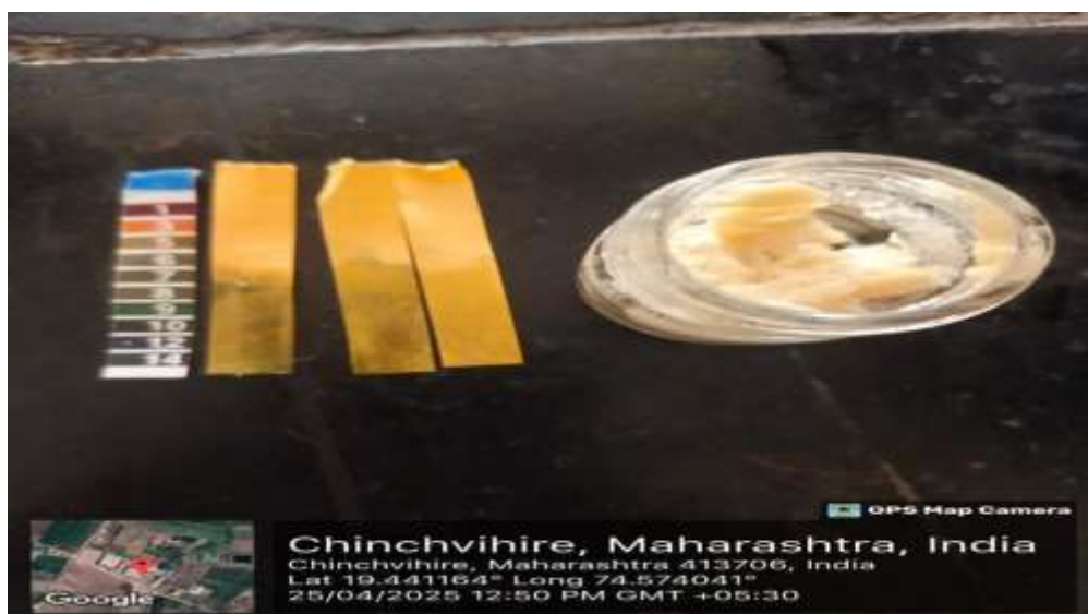
Fig. No. 13: pH Test.