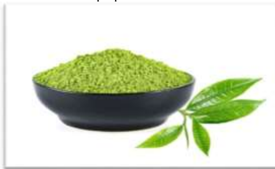
Fig. No. 4: Green tea powde.

Protects skin from damage, reduces inflammation, and exhibits antioxidant properties.