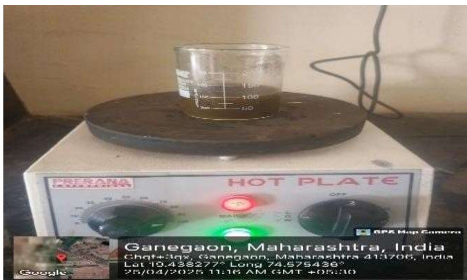
Fig No. 11: Green tea brewing.