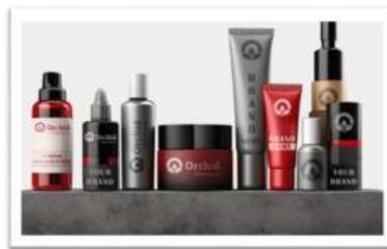
Fig. No 1. Cosmetic Product.

Skin is one of the largest organs of the body. Skin functions as a defensive wrapper, keeping everything beneath it safe from diurnal pitfalls similar as the harsh goods of sun, wind and pollution, origin filled smut. Skin is also a sensitive organ, which indicates the health of an individual Skin care is veritably important to make it bealthy and fresh there are so numerous request medications for skin care Skin care is at the interface of cosmetics and dermatology but skin care differs from dermatology, it does n't bear any medical professional every time Cosmeceuticals are the unborn generations of skin care. The term ornamental deduced from Greek word" Kosmetikos" which mean pertaining to cosmetics or beautifying substance of medication. The word' cosmesis'(Gr. Kosmesia) used for two effects. the preservation restoration or bestowing of body beauty, the surgical correction of disfigured physical effect. Cosmetics are defined as the products used for the purposes of sanctification, beautifying. promoting attractiveness or interspersing the appearance.