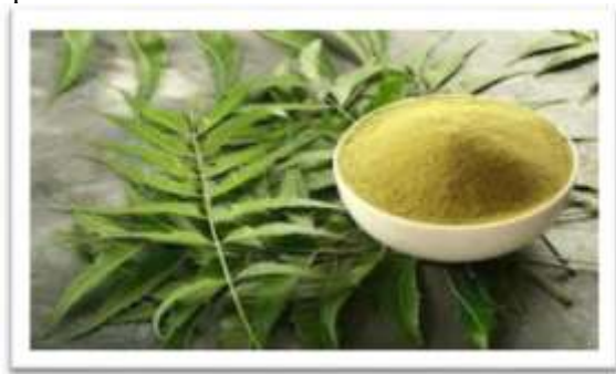
Fig. No. 3. Neem Powder.

Exhibits antimicrobial, anti-inflammatory and antifungal properties.