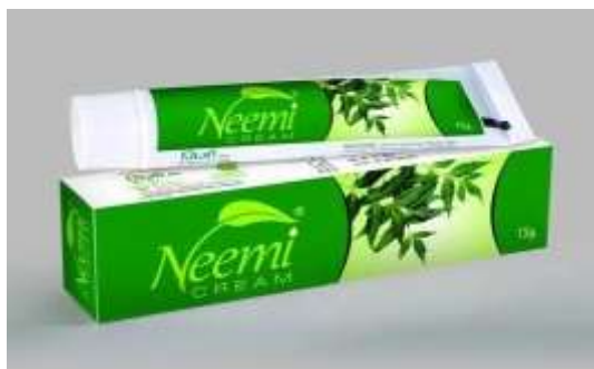
Fig. No. 2: Anti acne cream.

A Journey Through Nature's Garden Step into the realm of herbal acne creams, and you will embark on a sensitive trip through nature's theater. Lavender's delicate scent transports you to sun kissed meadows, while the cooling sensation of peppermint invigorates the senses. With each operation, you will witness the transformative power of factory- grounded skincare, as botanical excerpts inoculate your skin with vitality and radiance. The Promise of Radiant Skin In the hunt for radiant skin, herbal acne creams crop as loyal abettors, bridging the gap between nature and wisdom with wisdom passed down through generations. With their gentle yet important phrasings, they offer a lamp of stopgap to those navigating the tumultuous swell of skincare. So, embrace the mending touch of nature and embark on a trip towards clearer, healthier skin with herbal acne creams as your trusted companions.