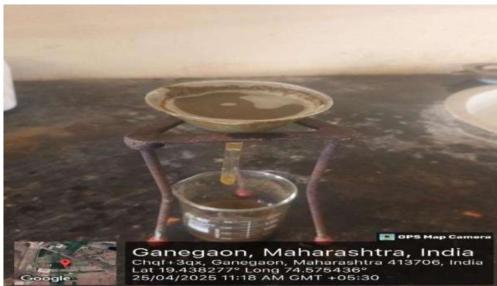
Fig. No. 12: Filtration of green tea.