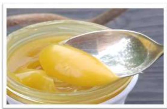
Fig. No. 6: Wool Fat.