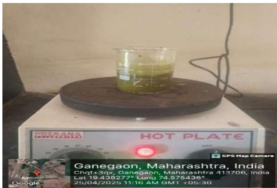
Fig. No. 09: Boiling process of neem birth.