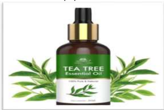
Fig. No. 8. Tea Tree Oil.

Soothes skin irritations, reduces inflammation, and exhibits antimicrobial properties.