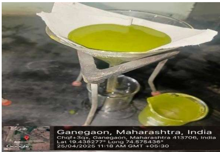
Fig. No. 10: Filtration of neem excerpt.