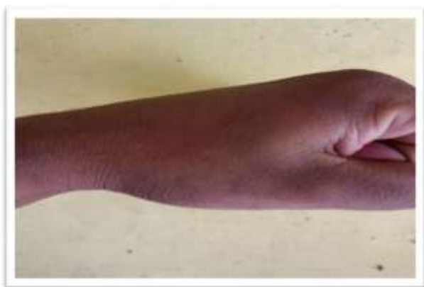
Fig. No. 14: Washability test.