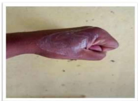
Fig. No. 15: Irritability test.

It was evaluated by patch test. It is not verified test but as per mentioned on marketed preparations label, had performed this test also. Little quantity of the cream was applied on the surface of skin and kept it as it is for few minutes.