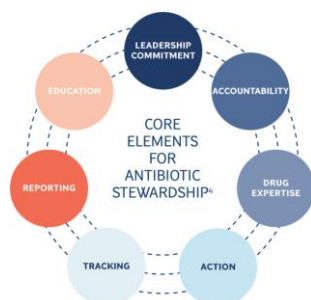
Figure 1: Core Elements for Antibiotic Stewardship.

By focusing on the core components like leadership and accountability, action, tracking and reporting, and education and training, ASPs can effectively optimize antimicrobial use, reduce resistance, and improve patient outcomes.