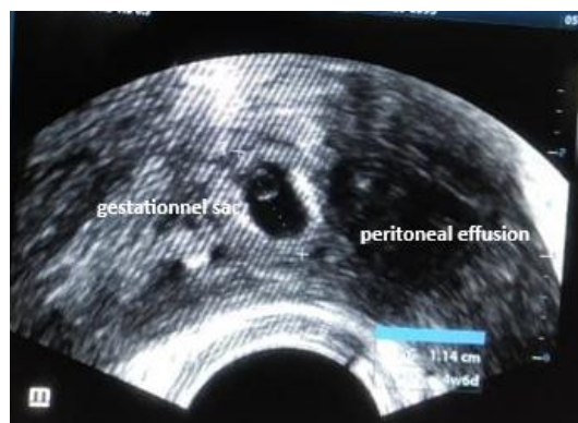
Figure 1: Transvaginal ultrasound showing a peritoneal effusion associated with a gestational sac.

Douglas without vaginal bleeding; abdomino-pelvic ultrasonography showed a very abundant hematic peritoneal effusion; transvaginal ultrasound showed the presence of a rounded mass containing a vetelline vesicle in the left latero-uterine region, corresponding to a gestational sac (Figure 1). Serum BHCG levels returned positive at 3500 mIU/ml. An emergency laparotomy was performed for a ruptured ectopic pregnancy, complicated by haemorrhagic shock, with life-threatening complications, which permitted aspiration of 1000cc of hemoperitoneum and localized the origin of the bleeding in the left ovary, which was tumefied and the site of a ruptured pregnancy (Figure 2). The patient benefited a left ovariectomy for hemostasis. histological examination confirmed the diagnosis of ovarian pregnancy. post-operative surveillance was unremarkable.