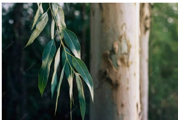
Fig. 3: Leaves of E.G. [23]