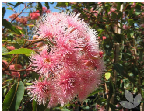
Fig. 1: Flower of E.G. [21]