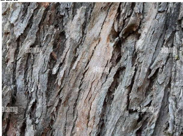
Fig. 5: Bark of E.G. [22]

Bark [20] : Every year, all eucalypts add a layer of bark, and the top layer degrades and dies. About half of the species lose their dead bark, revealing a brand-new covering of living, fresh bark. Large slabs, ribbons, or tiny flakes of dead bark can all be shed. [20]