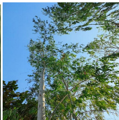
Fig. 4: Whole tree of E.G.

Appearance: The eucalyptus globulus tree has a strong scent. typically reaches heights of 150-180 feet (45.7-54.9 metres) and diameters of 4 to 7 feet (1.2-2.1 m). a well-developed crown, a straight stem that extends to nearly two-thirds of its height.