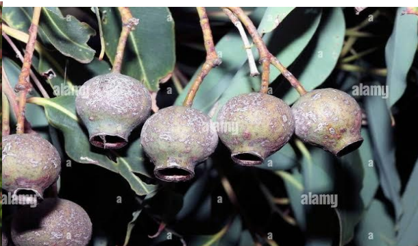
Fig. 2: Fruit of E.G. [22]