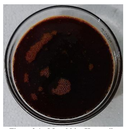
Fig.no.2.1: Murchhita Katu taila