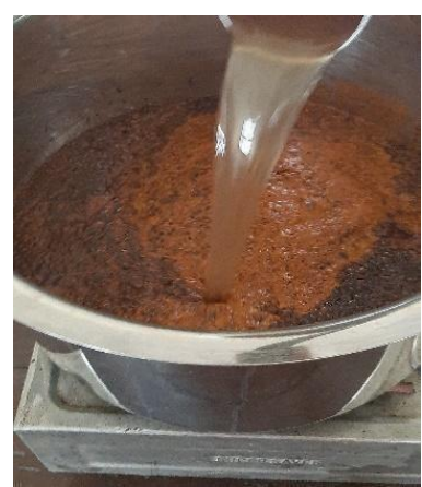
Fig.no.2.4 Addition of Gomutra