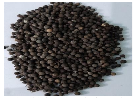
Fig.no.1.1.Vidanga (Embelia Ribes Burn)