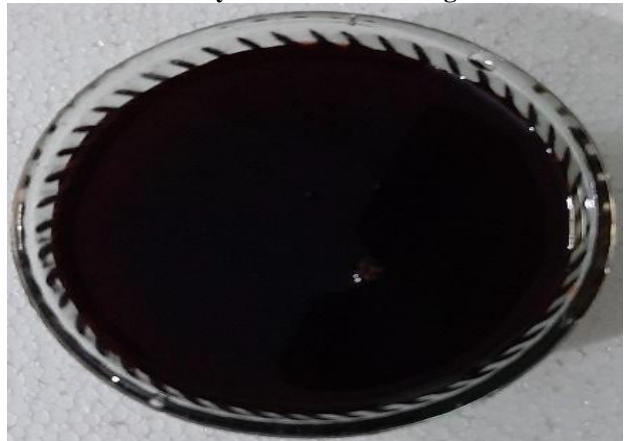
Fig.no.2.5 : Prepared Vidanga taila Figures No. 2: Pharmaceutical Preparation of VidangaTaila.