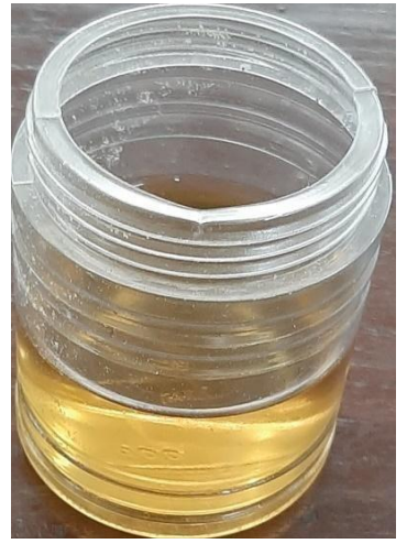
Fig.no. 1.5: Gomutra( Fresh Cow Urine ) Figure No. 1: Drugs Used In The Preparation Of Vidanga Taila.