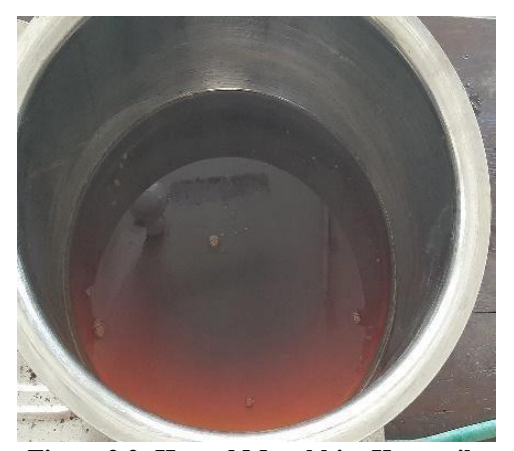
Fig.no.2.2: Heated Murchhita Katu taila