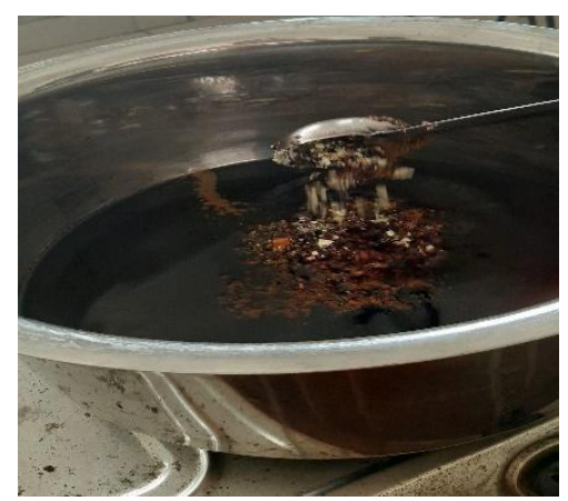
Fig.no.2.3: Addition of Kalka Dravyas