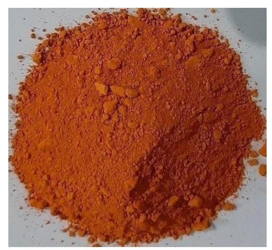
Fig.no.1.4: Shuddha Manahsila(Pure Realgar)