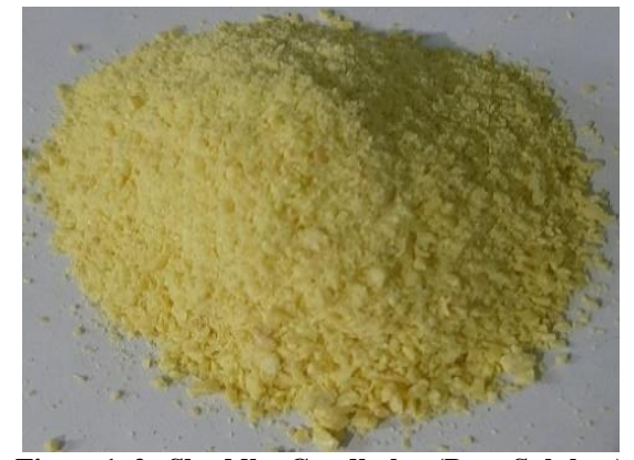
Fig.no.1. 2. Shuddha Gandhaka (Pure Sulphur)