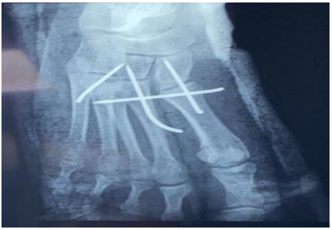
Figure 4.a: Reduction of dislocation with percutaneous pinning.

The patient was admitted to the operating room on an emergency basis, where she underwent reduction under spinal anaesthesia and percutaneous pinning.