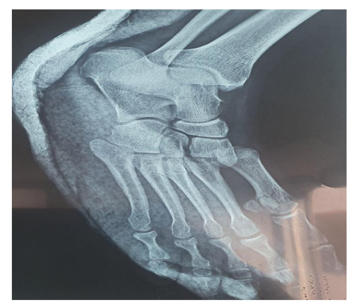
Figure 3.b: X-ray of the foot ¾ confirming the injury and the absence of other associated injuries.

The patient was admitted to the operating room on an emergency basis, where she underwent reduction under spinal anaesthesia and percutaneous pinning.