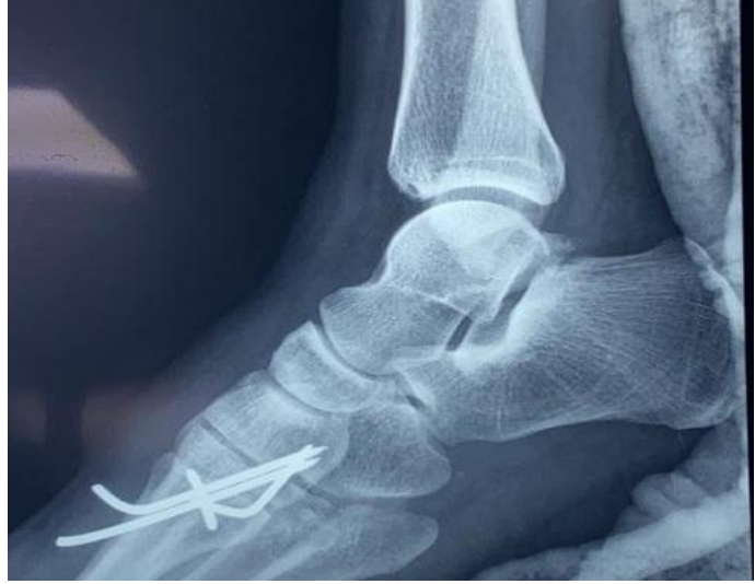
Figure 4.b: Profile view of reduction and pinning.