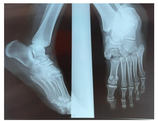
Figure 1: Face + <sup>3</sup>/<sub>4</sub> views of the foot showing a homolateral columno-spatellar tarsometatarsal dislocation.

Standard radiography showed a homolateral columno-spatular dislocation.