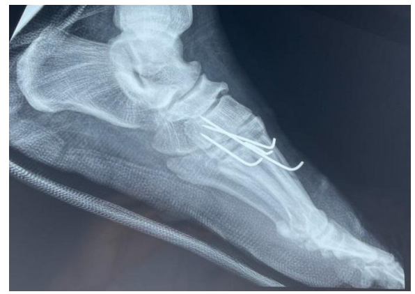
Figure 2.a: Percutaneous pinning of a Lisfranc dislocation seen in profile.

The patient was taken directly to the operating room where he underwent reduction under RA, followed by fixation by percutaneous pinning.