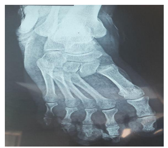
Figure 3.a: X-ray of the front foot showing a divergent columno-spatular dislocation.