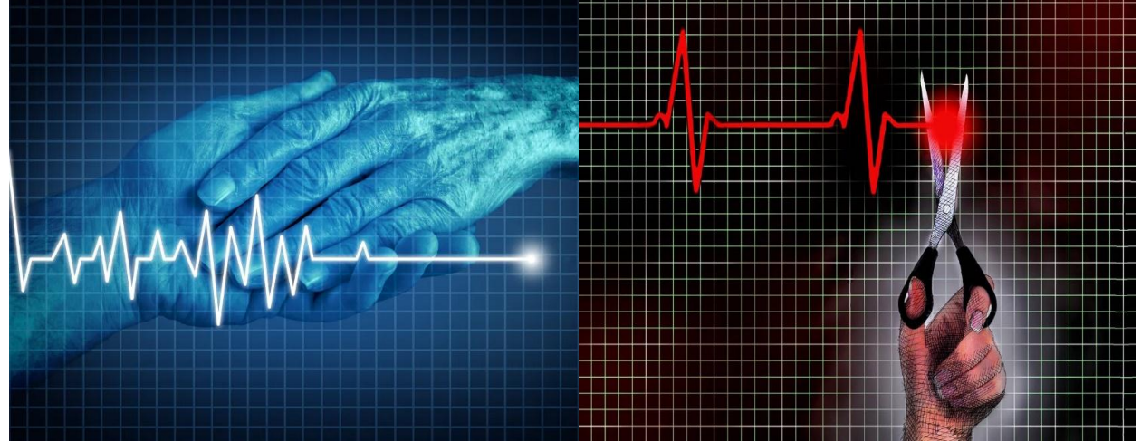
Figure-5: Euthanasia and end of life.

Passive euthanasia was declared legal by Israel's highest court under certain conditions and has reached some level of acceptance. Active euthanasia remains illegal; however, the topic is actively under debate with no clear consensus through legal, ethical, theological and spiritual perspectives.