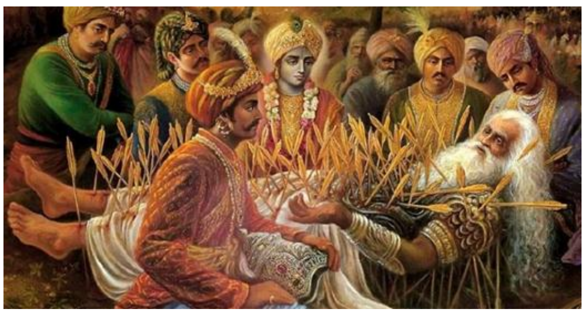
Figure-2: Bhishma Pitamah of Mahabharat going to embrace death.

Euthanasia (from Greek: εὐθανασία 'good death': εὖ, eu 'well, good' + θάνατος, thanatos 'death') is the practice of intentionally ending life to relieve pain and suffering. A mercy killing is the intentional ending of life of a person who is suffering from a terminal, painful illness. The term—also called "right to die"—is most often used to describe voluntary euthanasia, though it is also used in reference to non-voluntary euthanasia and involuntary euthanasia.