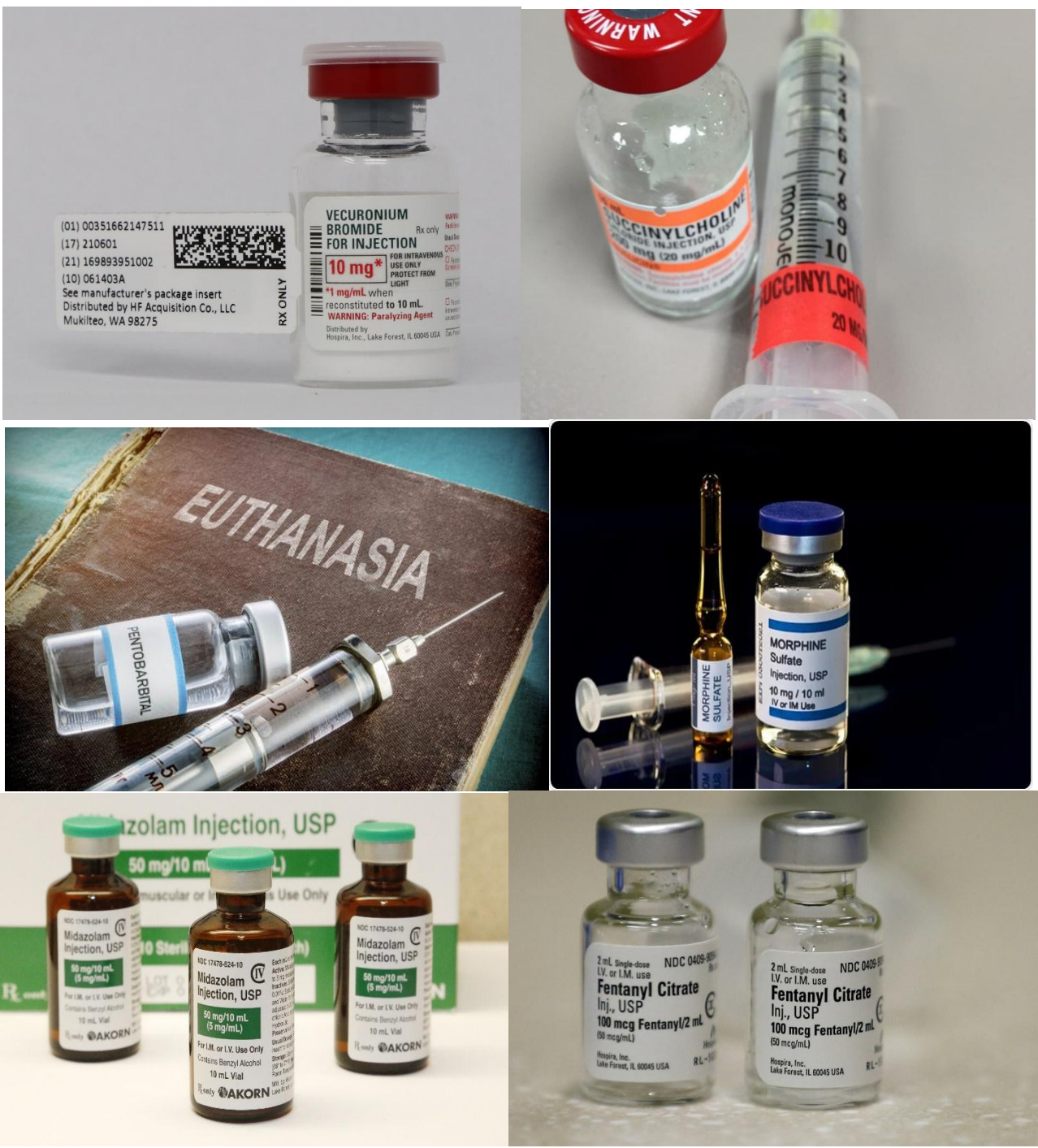
Figure-4: Death drugs.

Furthermore, the cause of suffering underlying the request must have a medical dimension, either somatic or psychiatric, and physicians must report each case to the Regional Euthanasia Review Committees which review all EAS cases regarding whether the due care criteria were met. In the past decade, the percentage of all deceased patients in the Netherlands who requested EAS prior to their death increased, from 5.2% in 2005, to 6.7% in 2011, and to 8.4% in 2015. Also, the percentage of requests that were carried out increased, from 37% in 2005, to 45% in 2010 and to 55% in 2015. Hence, not only is there a growing demand for EAS, requests are