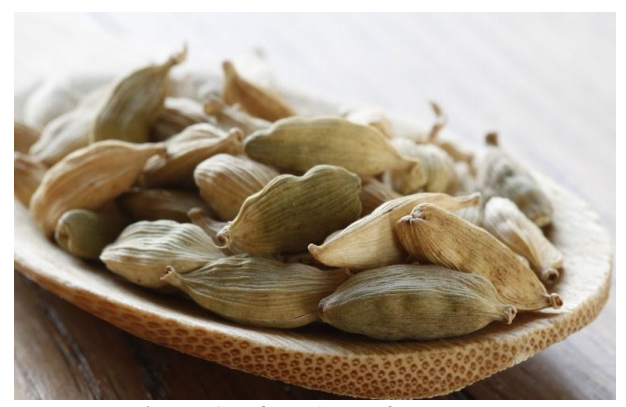
Figure 1: Elettaria cardamomum.

also considered as a diuretic, carminative, aromatic stimulant. [15-19] Ancient Indian Ayurvedic and Unani practitioners and ancient Greek and Roman physicians used Elettaria cardamomum for treating indigestion, bronchitis, asthma and constipation, anorexia, diarrhoea, dyspepsia, epilepsy, hypertension, cardiovascular diseases, ulcers, gastro-intestinal disorders and vomiting. [20,21] The pharmacological activities of the plant are anti-microbial, anti-cancer, immuno-stimulant, gastro-protective, anti-hypertensive, anti-oxidant and anti-inflammatory etc. India has a monopoly in cardamom trade. However, a decline in its production as well as exports has been faced. Many allegations have been put on the Indian Government for this decline. To maintain a standard in the production and export business of cardamom, India needs to take advantage of the World Trade Organization (W.T.O.) agreements' different provisions which are related to the trading of the spices trade. [22] The vernacular names and taxonomy of Elettaria cardamomum are given in table no. 1 and 2 respectively.