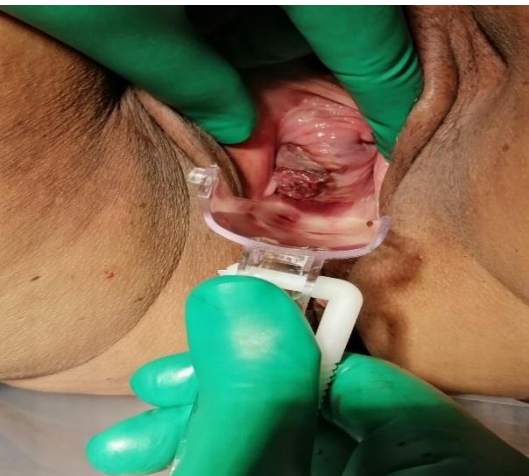
Figure 1: Vaginal Tumor During Speculum Examination.

Digital rectal examination is normal. pulmonary auscultation shows a pulmonary condensation syndrome with abolition of vesicular murmur, and reduction of vocal vibrations.