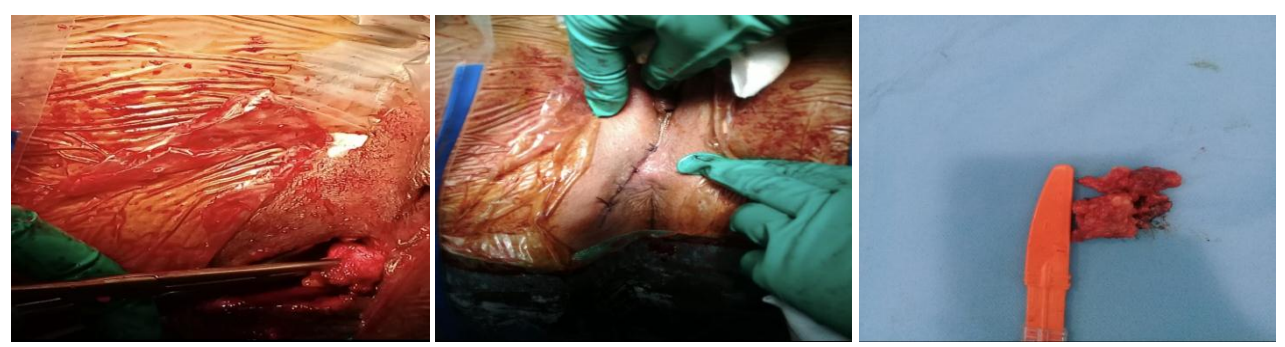
Figure: resection of the endometriotic nodule

gesture pare, a 2 year old child born by low way with episiotomy, complicated by a hemorrhage of the delivery with uterine revision. She consults for cyclic pelvic pain at the level of the episiotomy scar dating back to 9 months. The clinical examination found a 4 cm mass at the episiotomy scar. Perineal ultrasound revealed a heterogeneous hypoechoic, non-vascularized image of the episiotomy scar measuring 3.5/ 3cm. The patient benefited from resection of the mass, performed under spinal anesthesia, we made a biconcave incision around the episiotomy scar with subcutaneous detachment carrying the endometriotic nodule to the pararectal fossa (figure 1). Anatomopathological examination confirmed the diagnosis of endometriosis (Figure 2). The postoperative follow-up was simple, with a good evolution and a 12-month follow-up without any recurrence of the mass or pain.