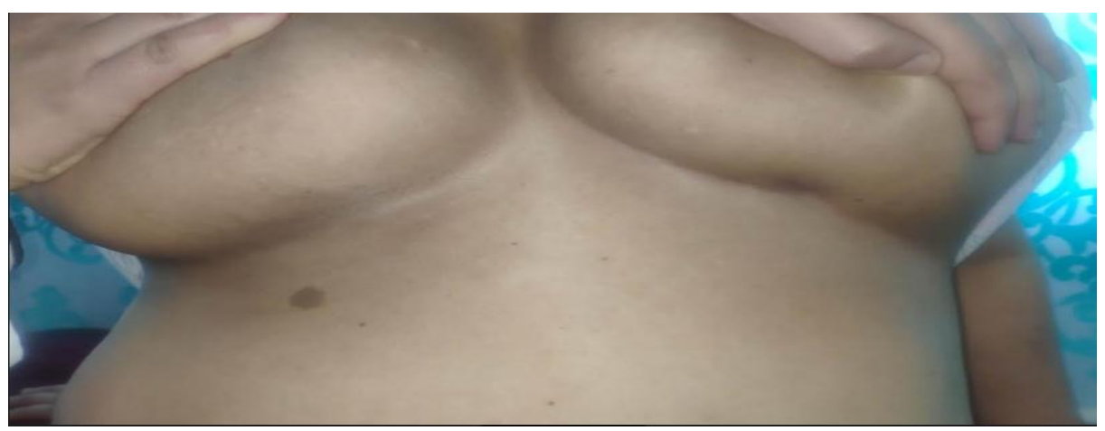
Figure 1: clinical appearence of the nodule.