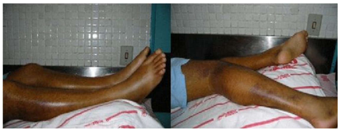
Figure-1: Leg of Rhabdomyolytic Patient.

Causes: Any form of muscle damage of sufficient severity can cause rhabdomyolysis. Multiple causes can be present simultaneously in one person. Some have an