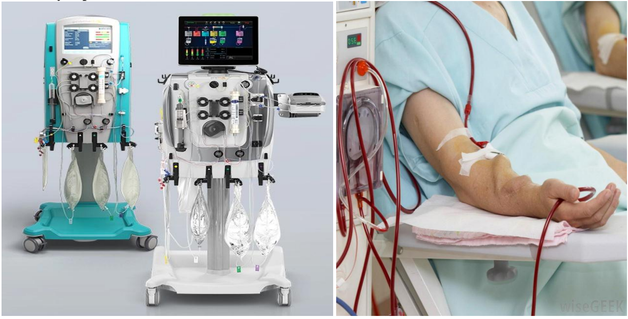
Figure-4: Haemofiltration Machine & Process Of Haemofiltration.

of calcium to protect against cardiac complications, insulin or salbutamol to redistribute potassium into cells, and infusions of bicarbonate solution. Calcium levels initially tend to be low, but as the situation improves calcium is released from where it has precipitated with phosphate, and vitamin D production resumes, leading to hypercalcemia (abnormally high calcium levels). This "overshoot" occurs in 20–30% of those people who have developed kidney failure.<sup>[9]</sup>