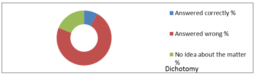
Fig. no. 2.

When tried to know about the term therapeutic privilege, only 38% participants answered correctly, and answers of 50% participants were wrong, and 14% were unaware about it. The correct answer for novus actus interveniens was given by 60% of participant, and that for medical jurisprudence was given by 82%.