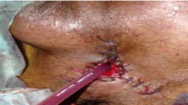
Figure 5: Périneostomie