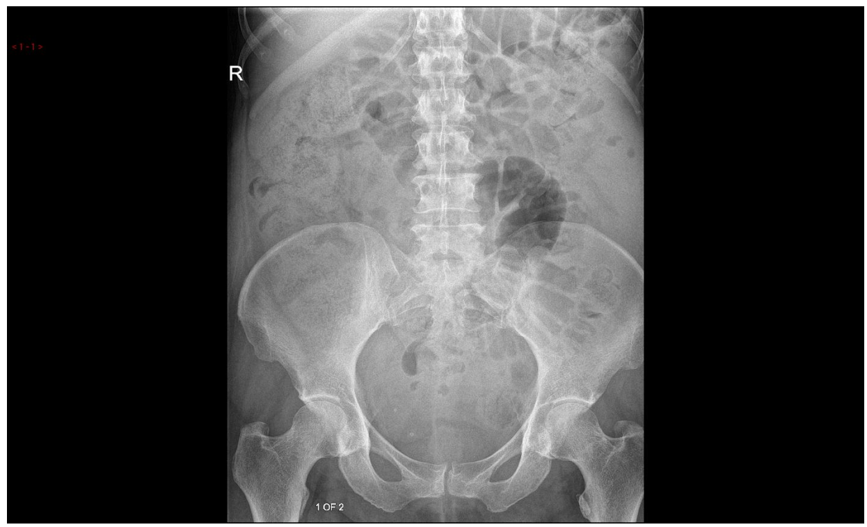
Figure 1: Plain film abdominal X-ray showing dilated loops of small bowel, faecal loading and no air in the rectum.