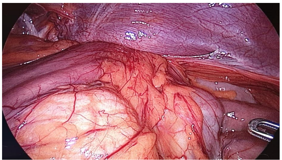
Figure 2: Intraoperative image - stomach and colon migration on the thorax through the diaphragmatic defect.