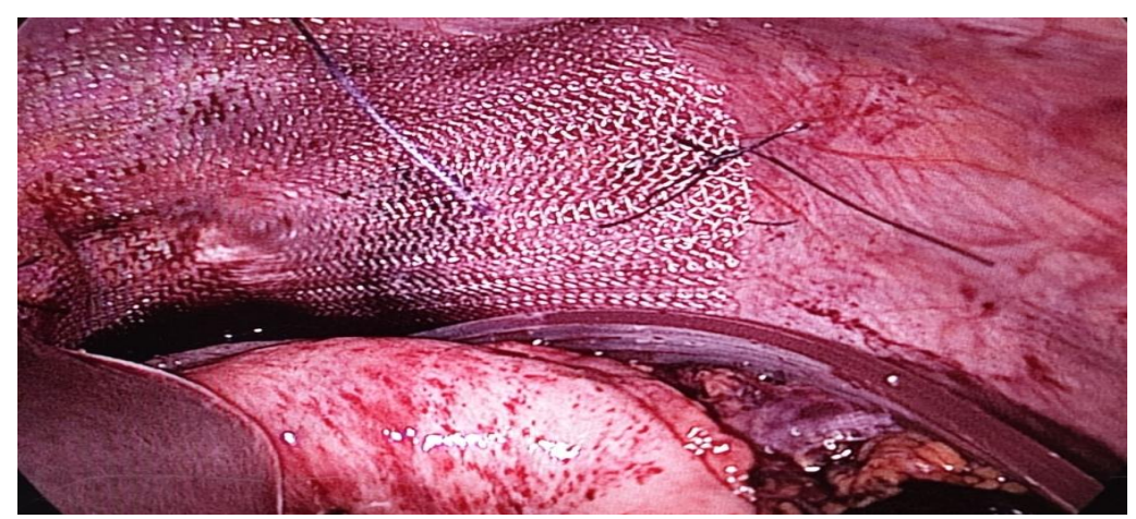
Figure 4: Intraoperative image- mesh fixation after the defect closure.