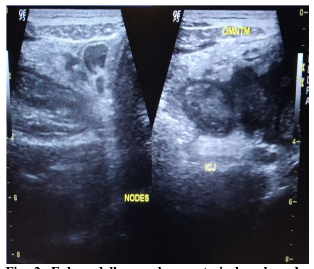
Fig. 2: Enlarged lleo-cecal mesenteric lymph nodes and mesenteric thickening in a case of enteric fever.