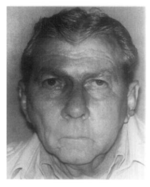
Figure 2: Lateral nasal-canthal prosthesis with projections and prosthesis in situ.<sup>[3]</sup>

For patients with total rhinectomy, natural undercuts offer less chance for retention of nasal prosthesis if the maxillary sinuses are not exposed. Hence, maxillary sinuses can assist for retention of nasal prosthesis if they are open as shown in the Figure 3. [3]