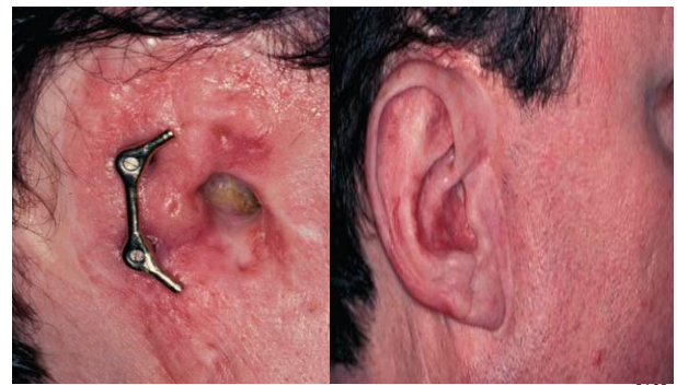
Figure 7: Retentive bar and ear prosthesis in situ. [12]

This method gives an even good force distribution on the implants. For this reason, it is preferred to use with auricular and large orbital prostheses. [5,12] Figure 7 demonstrates a bar retained auricular prosthesis.