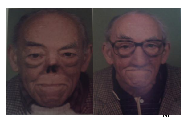
Figure 5: Defect site and nasal prosthesis. [2]

Spectacles can be used to retain extra-oral prosthesis. This method is considered as basic and user friendly method especially for elderly patients with limited dexterity. In the past, this method has been used to retain auricular prosthesis, however it has many problems. One of these problems is related to the pressure that is result from the eyeglass and prosthesis to the nose. Another problem is associated with stability of prosthesis during movement of the tissue. [1,2] For patients with partial or total rhinectomy, spectacles can be used to retain nasal prosthesis that is fixed to the frame by using clear acrylic resin. This method is preferred in patients who have limited dexterity. The most common problem that is associated with method is the movement of eyeglass frame, where this movement transfers to the prosthesis and affects the stability of prosthesis. To overcome this problem, a lock that is placed behind the ear can retain the eyeglass frame and prosthesis. Another important issue is that the prosthesis is attached to the frame and this means the patient is not able to remove his/her eyeglass without prosthesis.<sup>[1,2]</sup> Figure 5 illustrates the defect site and nasal prosthesis.<sup>[2]</sup>