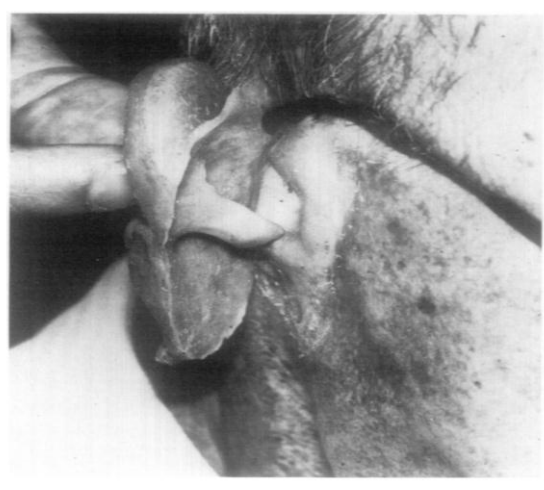
Figure 4: Silicon rubber extension which engages undercuts in the external auditory canal. [3]

In case of total missing ear, open external auditory canal can assist in retention of auricular prosthesis but this will affect the hearing. Hence, this method is contraindicated. Figure 4 illustrates silicon rubber extension, which engages undercuts in the external auditory canal. [3]