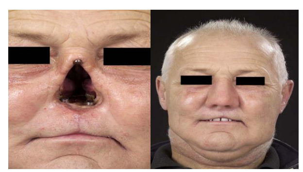
Figure 9: Three magnets in the nasal defect and nasal prosthesis in situ (Ethunandan et al. , 2010). [14]