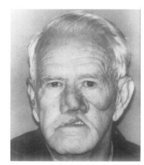
Figure 1: Lateral nasal defect and anatomically nasal Prosthesis. ^{[3]}

Figure 2 demonstrates lateral nasal-canthal prosthesis with projections providing vertical and lateral resistance to displacement. [3]