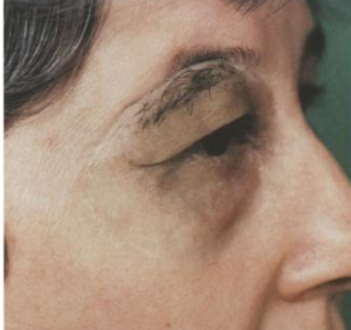
Figure 10: Orbital defect with magnets and Prosthesis in situ.<sup>[13]</sup>