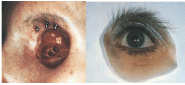
Figure 12: Orbital defect with ball abutments and prosthesis in situ. [15]

This method is recommended to use in case of shallow defects especially orbital defects where there is a little space. Three implants can produce optimum retention and stability for prosthesis. <sup>[5]</sup> Figure 12 shows the orbital defect with ball attachment and the prosthesis. <sup>[15]</sup>