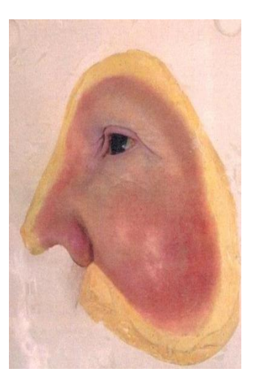
Figure 13(B): Hemi facial prosthesis.<sup>[1]</sup>