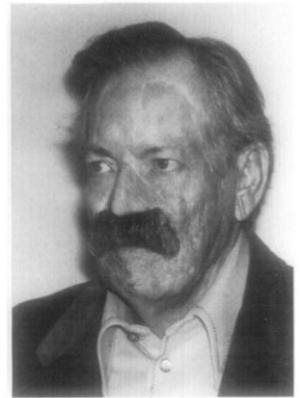
Figure 3: Nasal defect and anatomically retained nasal prosthesis. ^{[3]}

Intranasal anatomical retention provides good retention and aesthetic in the beginning but movement of adjacent tissue during eating, smiling and speaking affects the stability of prosthesis. Therefore, this method is preferred when there is a little movement and is recommended in partial defects.<sup>[1]</sup>