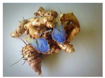
Figure 1: Rhizome of Curcuma ceasia Roxb. Ref. Curcuma caesia; www.ebay.com.