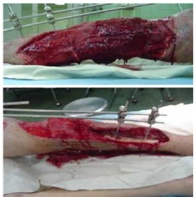
Figure 5: Patient with Open III-c Distal Femur Fracture with popliteal artery injury associated with tibia and fibula fracturewho underwent Popliteal Artery Bypass Grafting – note large leg avulsion with exposed tibia. However, it was the Popliteal Artery Bypass Graft that failed at 3 weeks, resulting in amputation.

Next patient was an open type III distal femoral fracture with popliteal artery bypass grafting and associated tibia and fibula fracture. Modified NPWT was set up over the external fixator, extremity developed gangrene due to failure of the popliteal artery bypass after 3 weeks. Patient underwent above knee amputation because of the gangrene. Healthy granulation tissue was observed at the open fracture site. This demonstrated the ability of modified NPWT to stimulate regeneration therefore not truly a failure of the procedure (Figure 5).