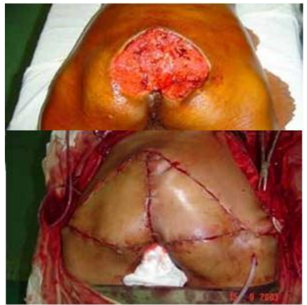
Figure 4: Decubitus ulcer in a 78 year old man. Good granulation tissue bed was achieved after 3 VAc changes. the soft tissue defect was covered using bilateral V-Y Gluteal advancement flaps.

Since infection management was also a purpose of this study, we looked at initial organisms cultured and interestingly found Staphylococcus aureus only three times common. The rest being various gram negative organisms such as Enterobacter, Enterococcus, Klebsiella, Proteus, E. Coli and Pseudomonas. Subsequent culture from repeat debridement yielded only Staphylococcus aureus two times common, rest being gram negative organisms again mostly E Coli, Pseudomonas, Enterobacter and indicating microbacterial flora in our hospital to be predominantly gram negative.