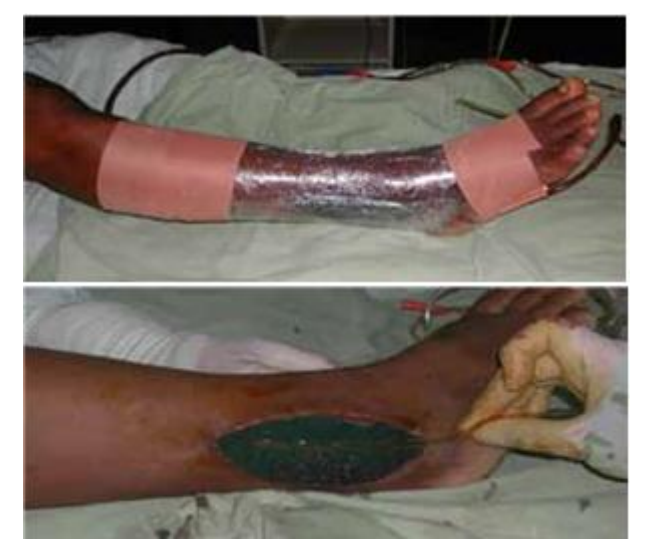
Figure 2: Foam is cut with a metz scissor in the shape of the wound. A Nasogastric tube or an infant feeding tube is placed in a tunnel of the foam. It is then wrapped by saran®wraps. the edges are obliterated by using Leukoplast® plaster tapes thus making it a sealed dressing.

A pre-sterilized Saran<sup>®</sup> wrap or Glad<sup>®</sup> wrap (Ioban<sup>®</sup>, Steridrap<sup>®</sup> or any brand of barrier drape) was wrapped around the area. The ends of this seal were then obliterated by applying Leukoplast<sup>®</sup> plaster tapes thus making it an air tight seal (Figure 2).