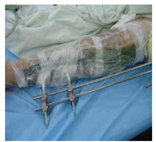
Figure 3: Applying VAC around a external fixator requires an extra effort. the saran® wrap are slit cut around the pins. Leukoplast® plaster tapes has to be properly applied around the pins so as to make it a sealed dressing.

The tube was then connected to the suction to check if the foam collapses, if not then we looked for any unsealed area then sealed it with more plaster tapes. In cases of external fixators, slit cuts on the Saran® wraps were made to seal pin sites and tapes around the pin sites sealed the area adequately (Figure 3).