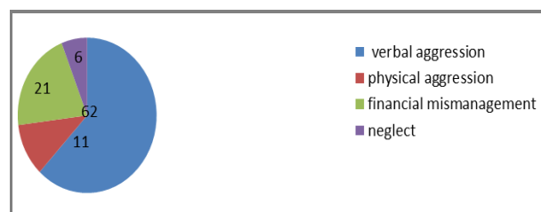
Figure 3: Type of abuse.

The total sample size of 100 patients, 62 patients had verbal aggression type of abuse followed by financial mismanagement with 21 and least were with history of neglect accounting for 6% patients.