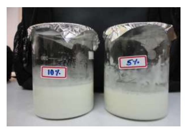
The composition of gel is shown in table 1.

stirring, required amount of sodium citrate was dissolved in 10 ml of distilled water and added to the mixture. Finally, rose oil was added slowly under stirring and speed was maintained appropriately. The mixture was allowed to cool to room temperature to form gel ( image:1 ).