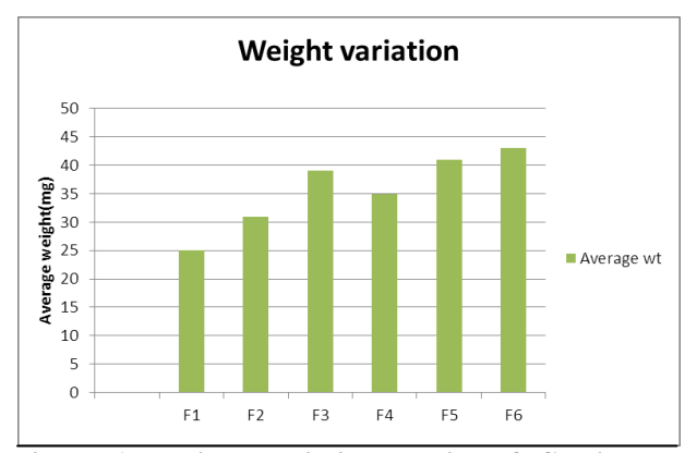
Figure 1: Weight variation studies of Clopidogrel bisulphate films.

The percent drug content observed between 97 to 150%. The values ensure good uniformity in the drug content in Fast Dissolving oral Film of Clopidogrelbisulphate. The results indicate that the formulation has good content uniformity and the drug is distributed uniformly.