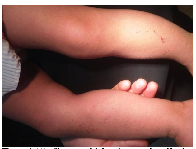
Figure 1 (A): Shows multiple micropapules affecting right knee region, both thigh and lower legs but right side was more affected in a child with APEC.

Most often the eruption consisted of erythematous micropapules which coalesced into poorly marginated eczematous plaques begin unilaterally close to a flexural area mainly around knee region in 60% of cases "Fig. 1:A and B" and" Fig. 2".