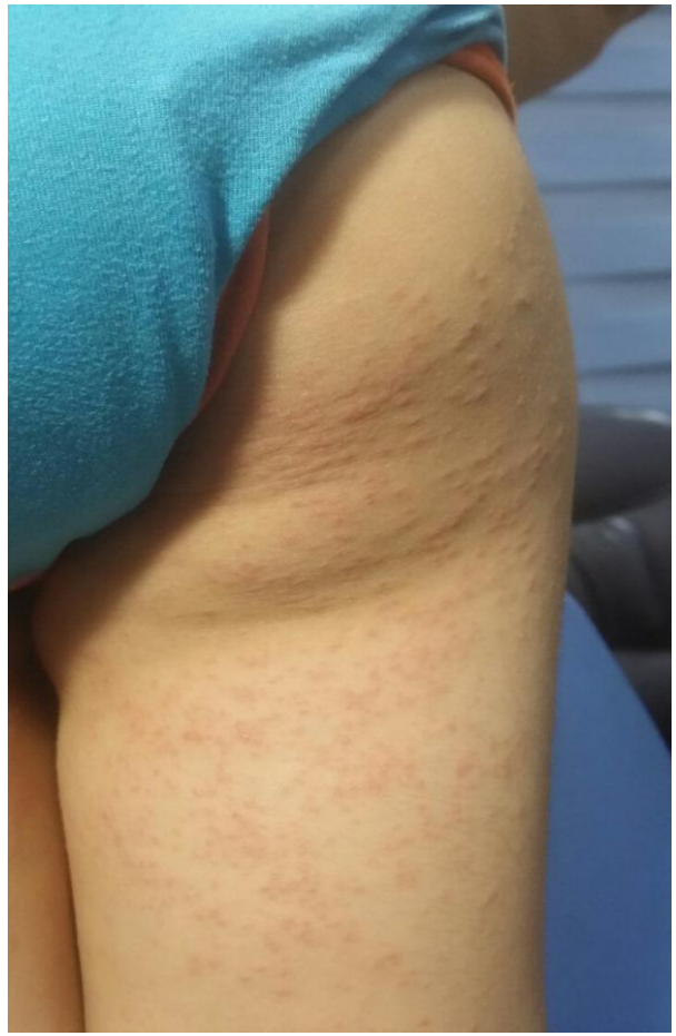
Figure 2: Other affected patient with APEC with involvement of the right buttock and lower thigh by multiple papules.

Wrist was affected in 12%, elbow and ankle, each affected in 8%, axilla 5.4%, groin in 4% and others in 2.6% of cases "Fig. 3".