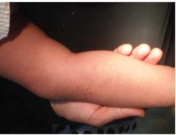
Figure 1 (B): Shows multiple micropapules affecting right knee region of the same child with APEC in Figure 1 (A).