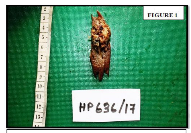
Figure 1: Gross picture of scalp tumour with cauliflower growth.

Microscopic features: Section showed skin with hyperkeratotic acanthotic papillomatous lesion with irregular down growths composed of interconnected broad bands of squamous cells, also arranged in small islands and nests. Tumor stromal junction showed band of lymphocyte infiltration. Tumor cells were benign looking.