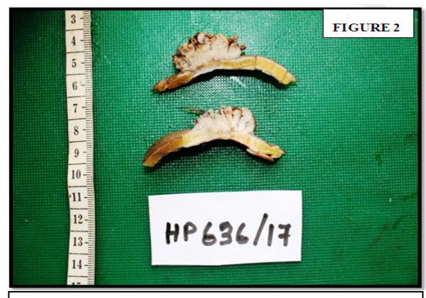
Figure 2: Cut section shows a proliferating growth from the skin.