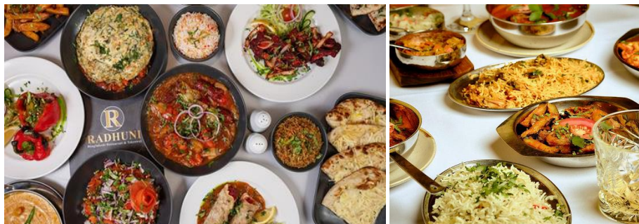
Figure-2: Radhuni culinary.

Binomial name: Psammogeton involucreatus