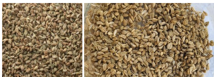
Figure-1: Radhuni & Ajwain.

Radhuni Biryani Masala: A rich blend of Garlic, Ginger, Fennel, Cinnamon, Coriander, Chilli, Cumin, Black Pepper, Cardamom, Bay Leaves, Mace, Caraway, Nutmeg, Clove, salt, and kewra flavor. Ingredients. Chilli, Garlic, Cinnamon, Ginger, Coriander, Sodium chloride, Aniseed, Cumin, Black pepper, Bay leaf, Cardamom, Mace, Caraway, Nutmeg, Clove, Food grade flavor.