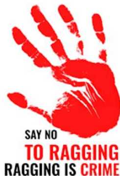
Figure 1: Stop Ragging.