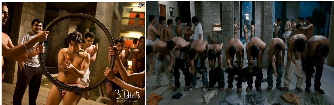
Figure 3: Ragging scene.

Forced Activities: Demanding that a junior or peer perform demeaning tasks, sing, dance against their will, or complete assignments for seniors.