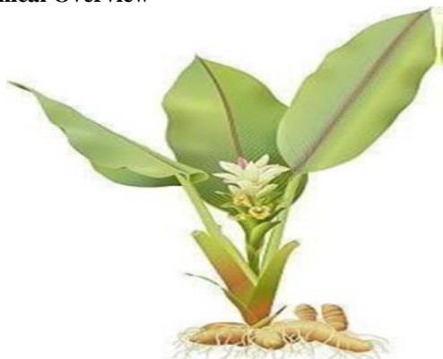
Fig No.3: Curcuma longa (Turmeric) Plant.