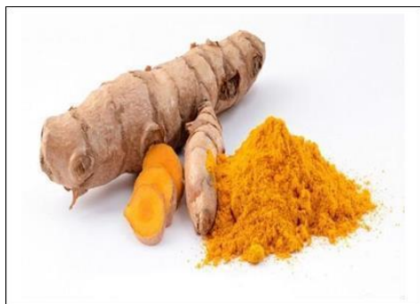
Fig. No. 4: Turmeric Rhizome and Powder.

Before drying, the fresh rhizome tissue is subjected to brief blanching that destroys enzyme activity, resulting in an aggregated mass. Blanching also results in the release of oil droplets and curcumin from the oil cells, creating vivid yellow color. All finished products are hard with good stiffness and density so that they sink in water. If the mass is broken, the cross-section area appears to be fine, waxy, and orange yellow. The outer layer of turmeric has about 1/4 the thickness (at least) of ginger outer layer and cannot be scraped off easily.