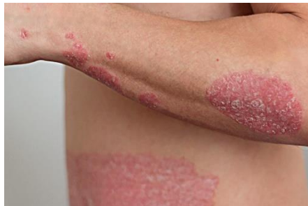
Fig No.2: inflammatory skin.

Every day, external factors cause damage to the integumentary system. Examples of this damage are cuts,