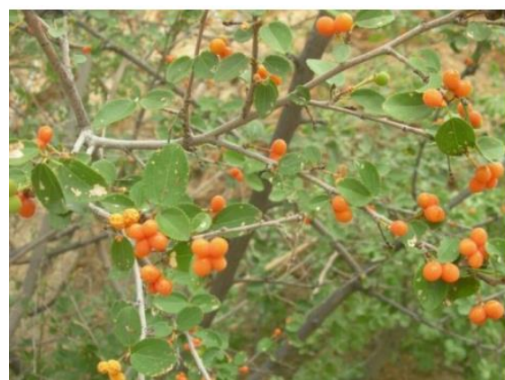
Fig. 1: Grewia Tenax Plant (Family: Tiliaceae).

Food: The fruits consumed by man and animals contain a large amount of iron and can be made into a refreshing drink. Fruit storage can be extended by drying. The dead leaves are eaten, but only while they remain on the plant. Its fruits are thirst quencher in summer season. A drink is prepared by soaking the fruit overnight, hand-pressing, sieving, and sweetening.