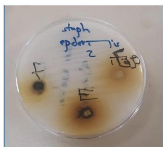
Fig. 2a: Staphylococcus Epidermidis Test.