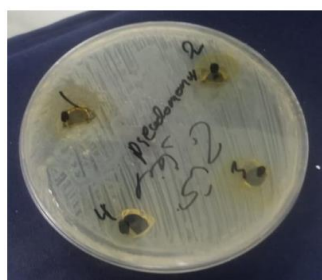
Fig. 2c: Pseudomonas Aeruginosa Test.