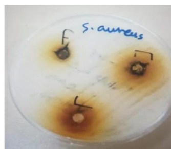
Fig. 2b: Staphylococcus Aureus Test.