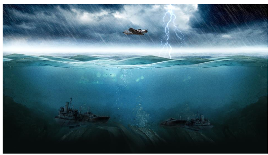
Figure 5: Bermuda Triangle disasters.

Rupture and Release: These hydrates can become unstable and rupture, releasing large quantities of methane gas into the water.