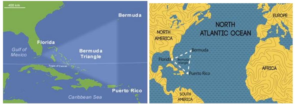
Figure 1: Bermuda Triangle location.

Location and Boundaries: The Bermuda Triangle is generally considered to be located in the western part of the North Atlantic Ocean. It is often depicted as a triangle with points at Bermuda, Florida, and Puerto Rico. However, there is no universally agreed-upon definition of its precise boundaries. The area is notorious for the unexplained loss of ships and planes, with some vanishing without a trace or transmitting distress signals.