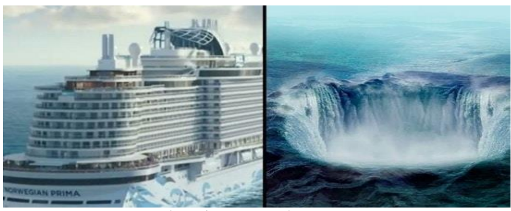
Figure 4: Bermuda Triangle trap.

Potential Concerns: Climate Change: The release of methane from hydrate deposits can exacerbate global warming.