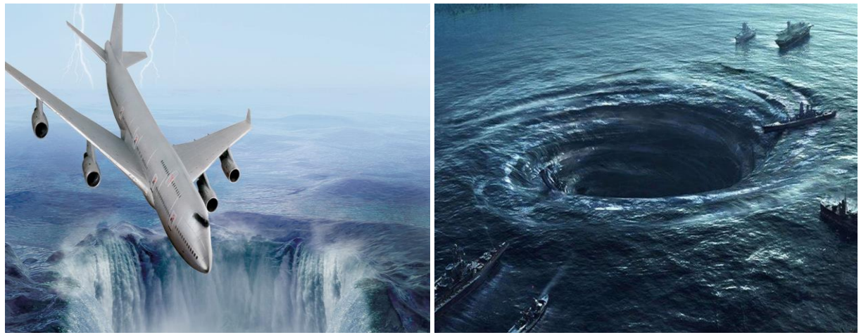
Figure 2: Mystery of Bermuda Triangle.

Structure: Methane clathrates are clathrate compounds, meaning they have a cage-like structure formed by water molecules that encloses methane molecules.